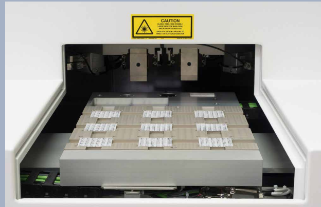
Standard flat vacuum chuck on the left and a custom fixture on the right for a 3x3 array of substrates.