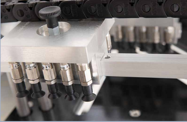
Pickup head for the optional stack loader.